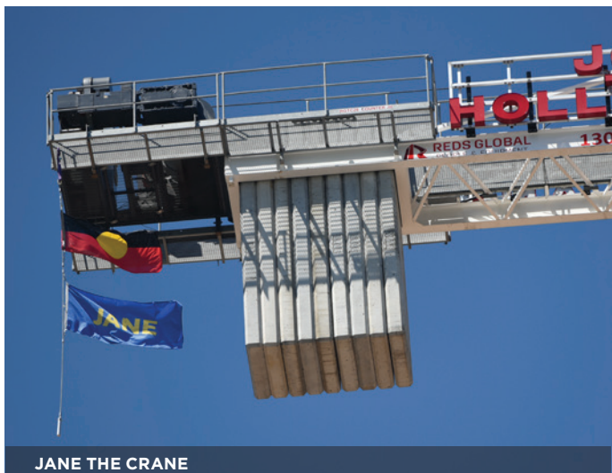
JANE THE CRANE