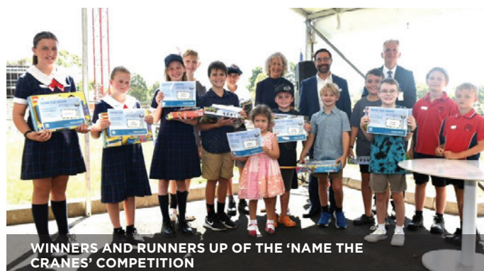
WINNERS AND RUNNERS UP OF THE ‘NAME THE CRANES’ COMPETITION

The winning names, along with several runners up, were selected by staff at Illawarra Shoalhaven Local Health District, Health Infrastructure, representatives from construction contractor John Holland and project managers, Johnstaff.