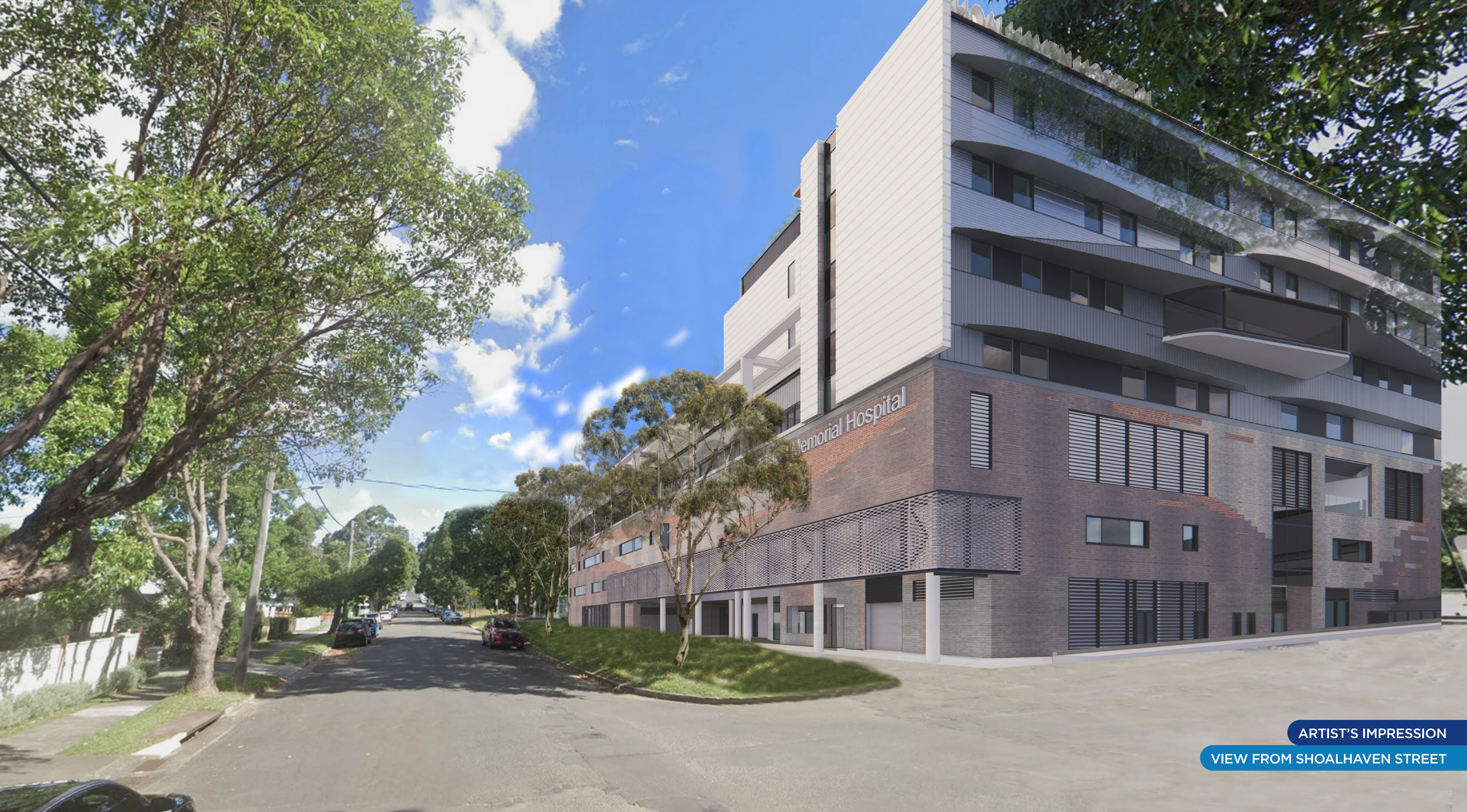
ARTIST'S IMPRESSION VIEW FROM SHOALHAVEN STREET